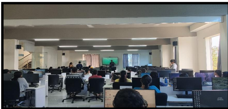
06-12-2024, 1:20 PM – 3:50 PM (CSE: Room No. 7311)