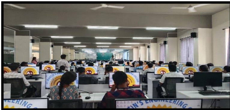
06-12-2024, 1:20 PM – 3:50 PM (CSE: Room No. 7112)