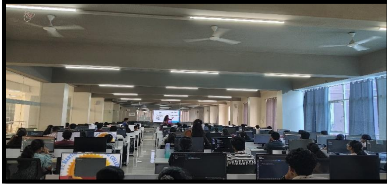
06-12-2024, 1:20 PM – 3:50 PM (CSE: Room No. 7111)