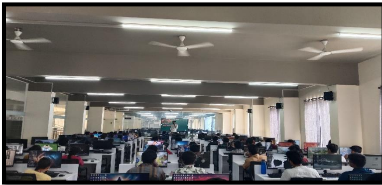
06-12-2024, 10:10 AM – 12:40 PM (ECE: Room No.7112)